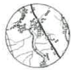
LOCATION MAP WEST VIRGINIA COUNTY MAP

CAPON DISTRICT HARRISBURG COUNTY, WEST VIRGINIA TAX MAP 26, PARCELS 19 AND 27